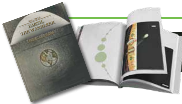
Vol. IX, Earth, The Wanderer

You are probably interested in rockets and space travel. Many people are.