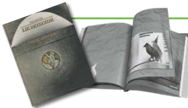
Vol. VII, Lie Detector

The sun is hot enough and close enough to warm up the world And you can guess what that means