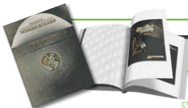
Vol. XVI, Women Rulers

The thread of woman's influence stands out in the unraveling of all recorded history