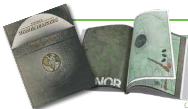
Vol. V, Honor Training

He was dressed like a crow in silky black feathers