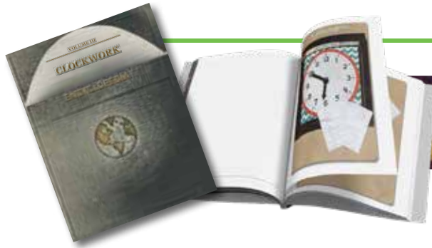
Vol. III, Clockwork

the luck cannot leak out A blister on your tongue means that you | have told a lie.