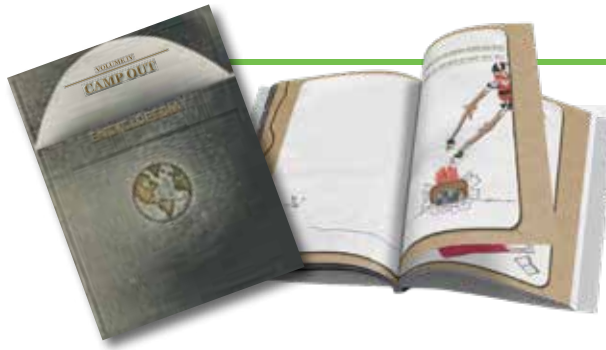
Vol. IV, Camp Out

the luck cannot leak out A blister on your tongue means that you | have told a lie.