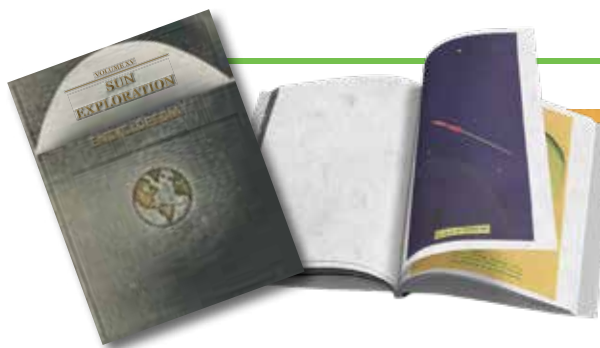
Vol. XV, Sun Exploration

The sun is hot enough and close enough to warm up the world And you can guess what that means