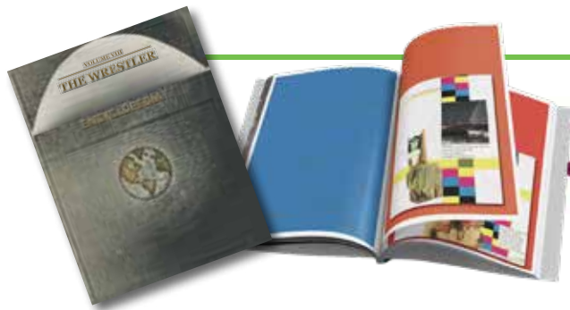
Vol. VIII, The Wrestler

You are probably interested in rockets and space travel. Many people are.